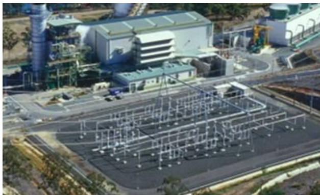
First Atlas gas sales to CleanCo in December 2019 and to CSR and Orora on 1 January 2020