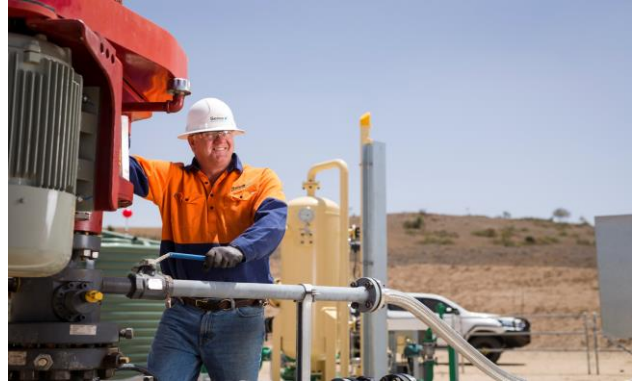
New wells being progressively brought online; 33 wells of 49 drilled on production; all wells online in coming weeks