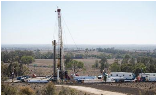
49 wells of current campaign drilled and completed; drilling efficiencies continue to improve