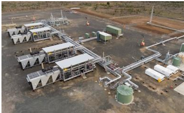
Roma North gas field has exceeded 13.5 TJ/day production