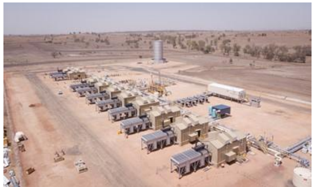
Atlas gas field producing above 6.5 TJ/day from 23 wells during early ramp-up