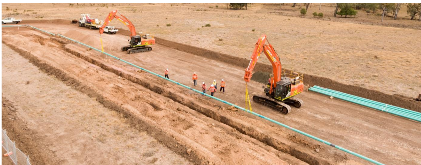
The first pipe is laid at Project Atlas in July 2019