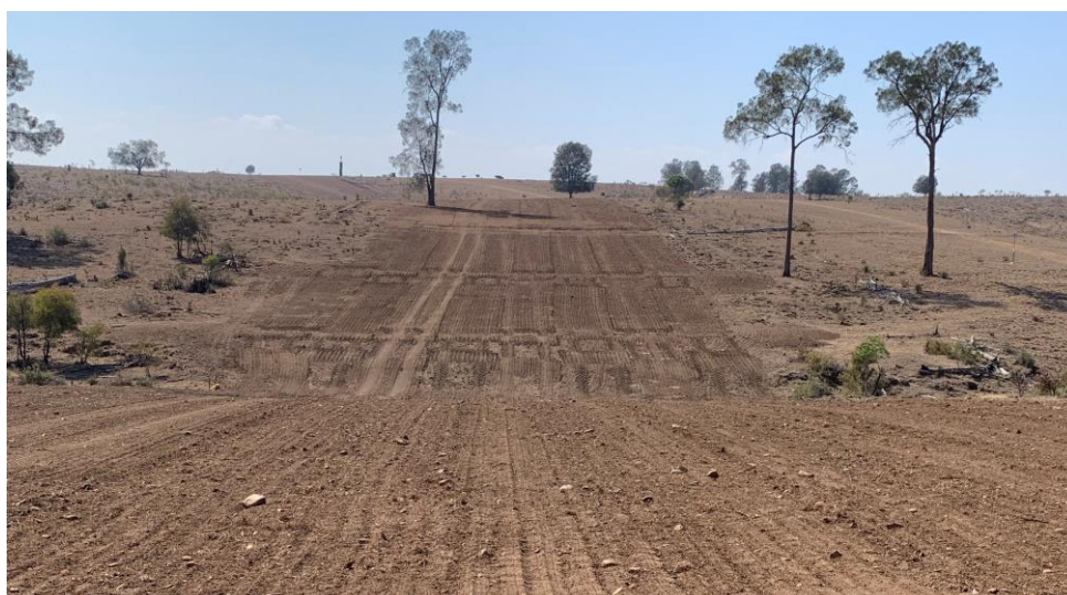
Project Atlas natural gas pipeline route following completion and rehabilitation