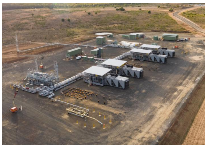
Roma North gas processing facility