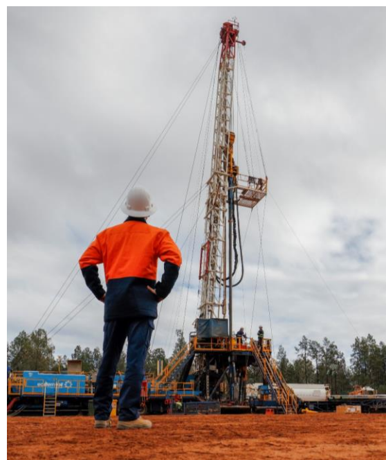
Easternwell rig 27 drilling ahead