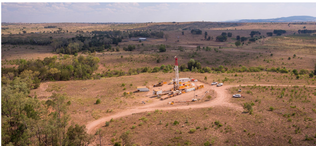
Typical well lease-pad and access road in the Surat Basin

This activity increases the momentum of our natural gas projects and continues the transformation of our business, with key milestones to follow in the coming months", he said.